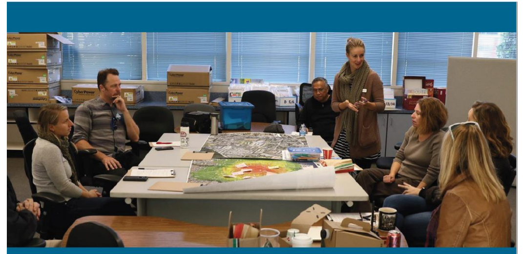
County of Santa Cruz/City of Scotts Valley Complete Streets to Schools Plan